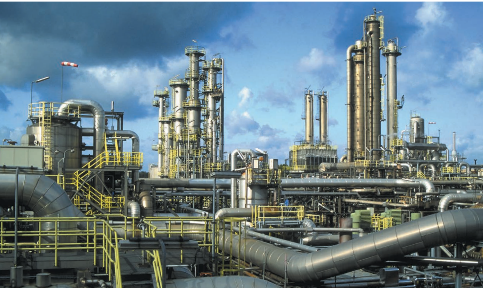
Wagma Engineering Pty. Ltd. - Proudly Australian owned & operated since 1975